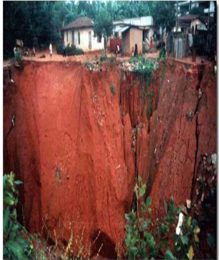
Homesteads perch precariously at gully's edge